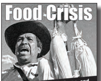
World Hunger, Agribusiness, and the Food Sovereignty Alternative by lan Angus

These pamphlets and more are available online at readingfromtheleft.com